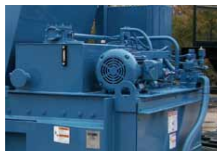
High-efficiency power unit with horsepower limited, pressure compensated piston pump.