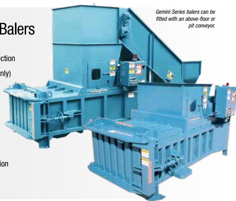
Gemini Series balers can be fitted with an above-floor or pit conveyor.