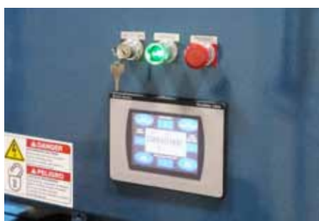
The touchscreen allows full automatic and manual control with one touch. Screens may be customized, password protected, and are designed with alarm, diagnostic and help screens.