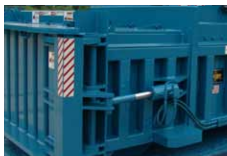
Marathon's Gemini Series balers feature a hydraulic door latch.