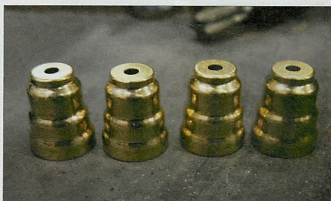
Each 7.3L Power Stroke injector sits in one of these brass sleeves, which is pressed into the cylinder head. Its purpose is to keep the injector and fuel separate from engine coolant, as well as help seal the fuel side of the injector. When a sleeve splits or cracks, you'll find fuel in the cooling system. This is because the 7.3L's fuel system typically sees 60 to 70 psi of fuel pressure, as opposed to less than 16 psi in the cooling system (essentially, fuel wins the battle and contaminates the cooling circuit). Being quite labor intensive, it's best to replace all of them at the same time.