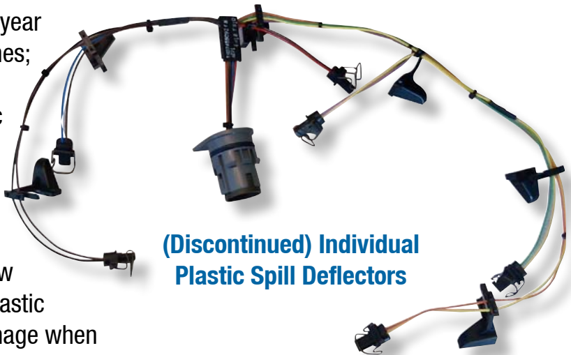
(Discontinued) Individual Plastic Spill Deflectors

Beginning with the 2000 model year DT466, DT530 and HT530 engines; the harness was changed to a design utilizing individual plastic spill deflectors that clips onto each injector solenoid. The original one piece metal tray was no longer used and the individual spill deflectors now supported the harness. These plastic spill deflectors are prone to damage when removed from the injector solenoid during servicing.